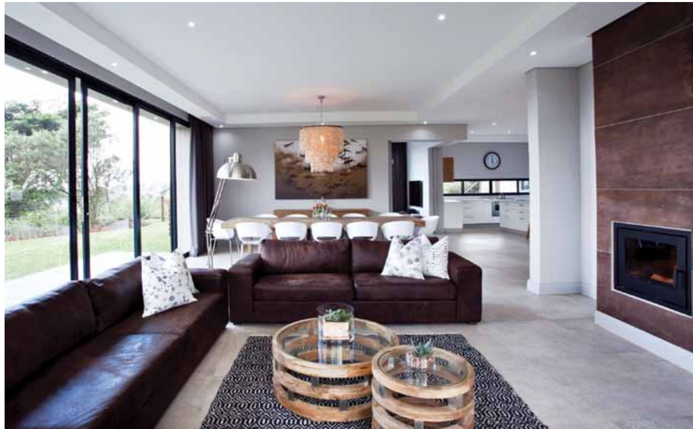
AFRIGRAN 031 577 8090

LEFT: Giving a fresh, modern look to the kitchen are the countertops supplied and installed by Afrigran, a stone fabricator that works with Caesarstone, Neolith, marble and granite products. Here the stone is Alaska Caesarstone, chosen for its neutral palette of white, black and wood.