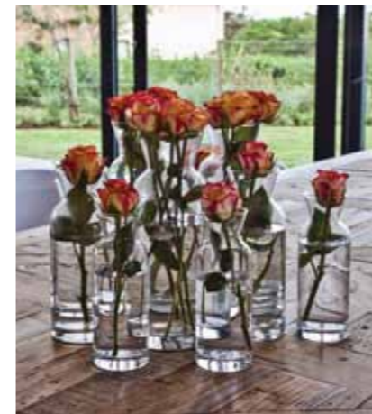
THE KITCHEN DEPOT 031 705 1184

RIGHT: Following a precise design brief that called for a kitchen of understated elegance, The Kitchen Depot was careful to acknowledge the design language throughout the home. The cupboard fronts were finished in Satin White Duco, while the stylised wall units are natural oak, topped off with Caesarstone tops in Alaska.