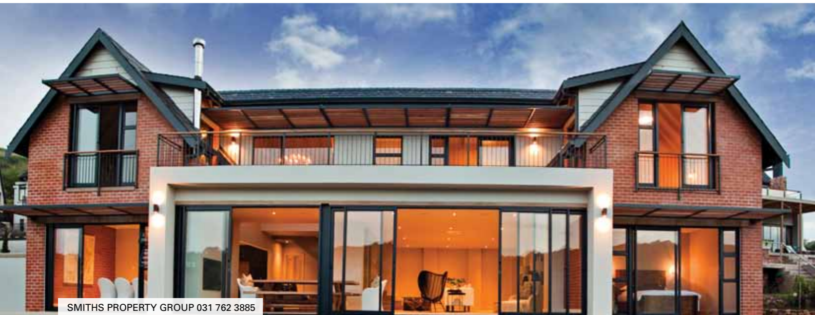
SMITHS PROPERTY GROUP 031 762 3885