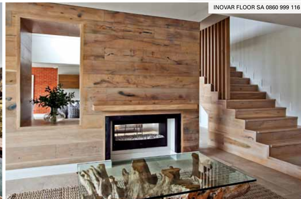
INOVAR FLOOR SA 0860 999 116